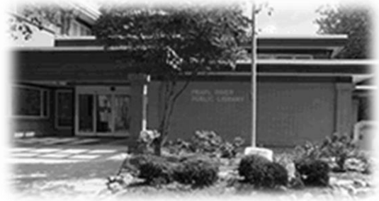
"Your Door to the World"